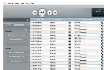
ARCHIVE AND RETRIEVE WITH THE PC CLIENT

The V-App is the mobile equivalent of the V-Tap. It stores the recordings in the telephone but, more important, it delivers them to the database of your choice, that can be either PC based or server based (the Apresa). The V-App and a single user PC client can be downloaded free.