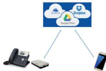
V-TAP SMALL BUSINESS USE WITH PRIVATE CLOUD