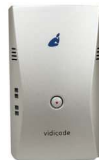
V-TAP VOIP / ANALOG / ISDN BRI

This is a small IP switch based Call Recorder that records up to 50 VoIP channels. It can be placed anywhere in the network, stores the recorded calls and sends them to the server type of your choice. Because of the capacity, one V-Tap may already be a complete solution for you. The V-Tap VoIP has three Ethernet ports and a USB port to make wiring very easy. Of course, it has an SD card slot.