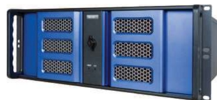
APRESA SERVER: ON PREMISE OR IN THE CLOUD

The Apresa is the state of the art call recording server and the flagship of the Vidicode product line. It can receive the recordings from any number of V-Taps and V-App equipped mobile phones around the world and handle the archive. It can combine V-Tap recordings with recordings derived from other sources such as direct links with business telephone lines or network providers. The Apresa is available as software or as a cloud based service.