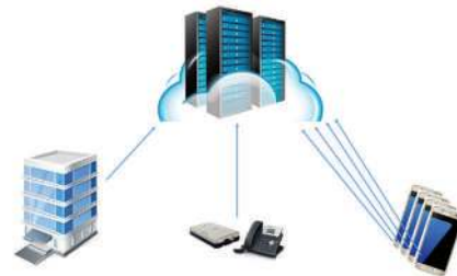
V-TAP MULTIPLE SOURCES, CENTRAL STORAGE