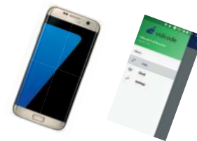
V-APP FOR MOBILE RECORDING

This is a small Call Recorder for one analog line with WiFi and Ethernet ports. It will be wired into a POTS telephone line or a phone handset and record all calls. Audio quality will be as good as the original.