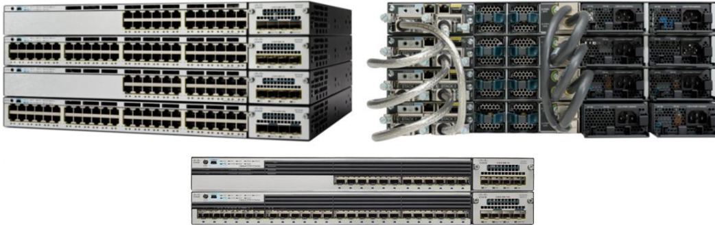
Figure 1. Cisco Catalyst 3750-X Series Switches (Front and Back)

Table 1 shows the Cisco Catalyst 3750-X Series configurations.