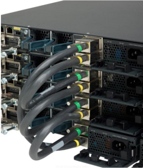
Figure 3. StackPower Connector

StackPower can be deployed in either power sharing mode or redundancy mode. In power sharing mode, the power of all the power supplies in the stack is aggregated and distributed among the switches in the stack. In redundant mode, when the total power budget of the stack is calculated, the wattage of the largest power supply is not included. That power is held in reserve and used to maintain power to switches and attached devices when one power supply fails, enabling the network to operate without interruption. Following the failure of one power supply, the StackPower mode becomes power sharing.