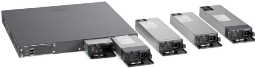
Figure 2. Cisco Catalyst 2960-XR Series power supply

Dual redundant power supplies are supported on the Cisco Catalyst 2960-XR Series Switches. These switches ship with one power supply by default. The second power supply can be purchased at the time of ordering the switch or as a spare. These power supplies have built-in fans to provide cooling (Figure 2).