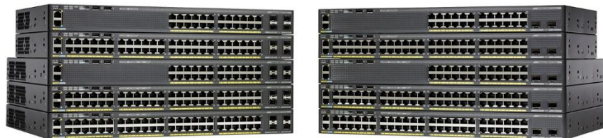
Figure 1. Cisco Catalyst 2960-X Series Switches

Cisco® Catalyst® 2960-X and 2960-XR Series Switches are fixed-configuration, stackable Gigabit Ethernet switches that provide enterprise-class access for campus and branch applications (Figure 1). They operate on Cisco IOS® Software and support simple device management as well as network management. The Cisco Catalyst 2960-X and 2960-XR Series provide easy device onboarding, configuration, monitoring, and troubleshooting. These fully managed switches can provide advanced Layer 2 and Layer 3 features as well as optional Power over Ethernet Plus (PoE+) power. Designed for operational simplicity to lower total cost of ownership, they enable scalable, secure, and energy-efficient business operations with intelligent services. The switches deliver enhanced application visibility, network reliability, and network resiliency.