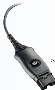
>> Quick Disconnect.