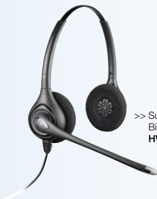
>> SupraPlus Wideband Binaural Headset. HW261N/DA-M