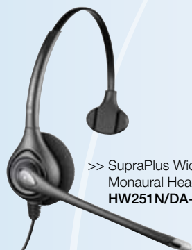
>> SupraPlus Wideband Monaural Headset. HW251N/DA-M