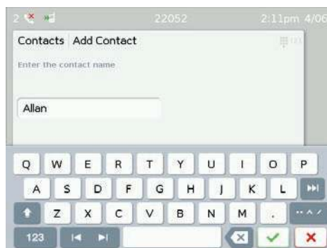
9670G virtual QWERTY keyboard

The new Avaya one-X® 9670G Deskphone is designed for the “Essential” user: someone who is constantly on the phone, handling multiple calls and is often mobile. The latest addition to the Avaya one-X line – designed to deliver powerful and consistent communications across a variety of end user devices – the Avaya 9670G is rich in features yet easy and intuitive to use.