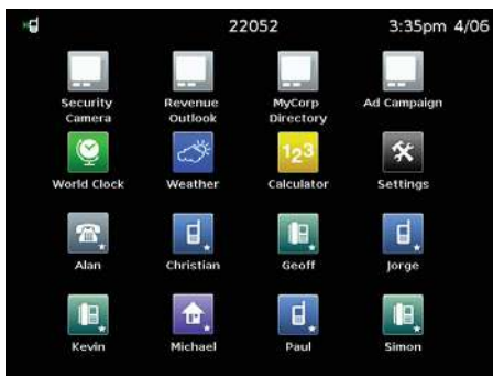
9670G home screen

Gigabit Ethernet and Bluetooth: integrated and ready to go. The Avaya 9670G comes equipped with Gigabit Ethernet and Bluetooth, streamlining the phone and simplifying operations and support for