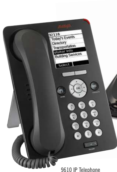
9610 IP Telephone

For the Navigator: the 9650 and Button Module. The Navigator also spends a great deal of time on the phone, largely handling calls for others. Receptionists and executive assistants are examples of Navigators. The 9650 provides one touch access to a great