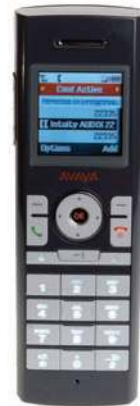
3631 Wireless IP Telephone

range of features and functions; it comes with an integrated button expansion module for quick access to features and people and super efficiency.