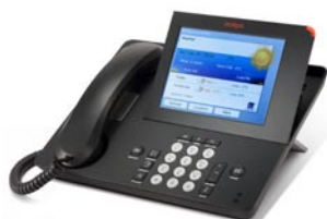
9670G IP Telephone