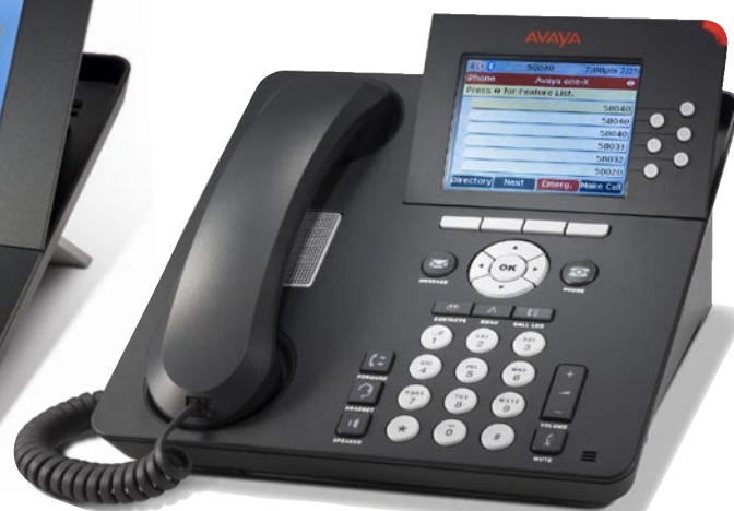
9640 IP Telephone