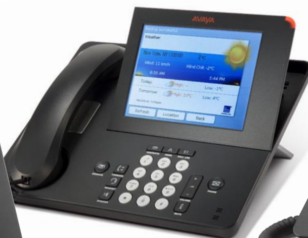
9670G IP Telephone