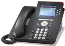
9640 IP Telephone