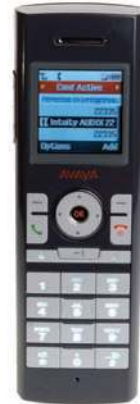
3631 Wireless IP Telephone

range of features and functions; it comes with an integrated button expansion module for quick access to features and people and super efficiency.