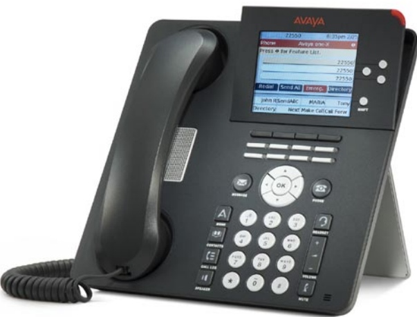
9650 IP Telephone