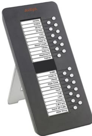
24 Button Expansion Module