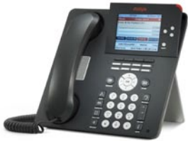
9650C IP Telephone