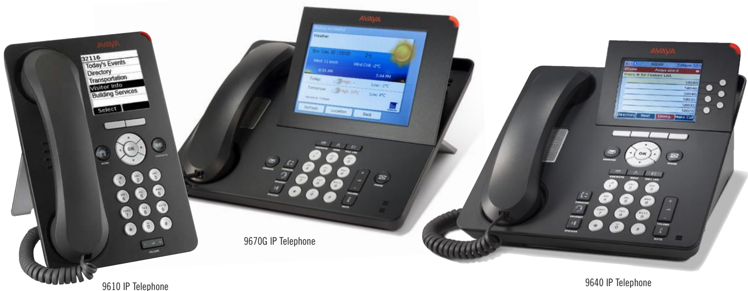
9610 IP Telephone

For the Navigator: the 9650 and Button Module. The Navigator also spends a great deal of time on the phone, largely handling calls for others. Receptionists and executive assistants are examples of Navigators. The 9650 provides one touch access to a great