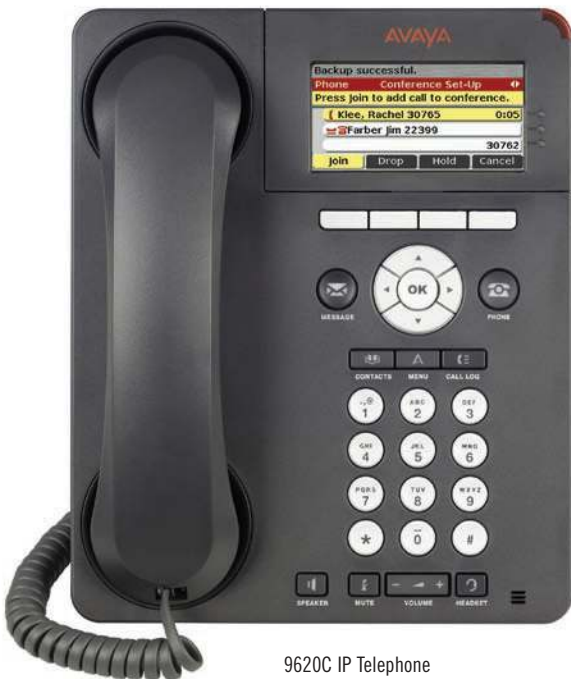
9620C IP Telephone

With the evolution of today's smart phones, PDAs, user interface design has made great leaps forward. Avaya's 9600 Series of IP Telephones have a clear and elegant interface. High resolution graphical displays make it easier to read contextual menus, prompts and instructions – anticipating your intentions and needs. Critical functions like call transfer, conferencing and forwarding are easy for beginner or veteran alike. Softkeys right on the display itself, along with scrolling menus, guide you through every process. Even third-party applications such as company-wide corporate directories can be invoked and used easily. The user interface is consistent across the entire