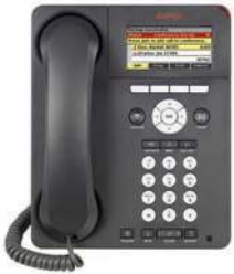
9620C IP Telephone