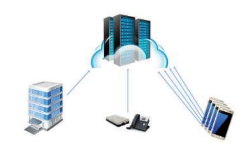
V-TAP MULTIPLE SOURCES, CENTRAL STORAGE