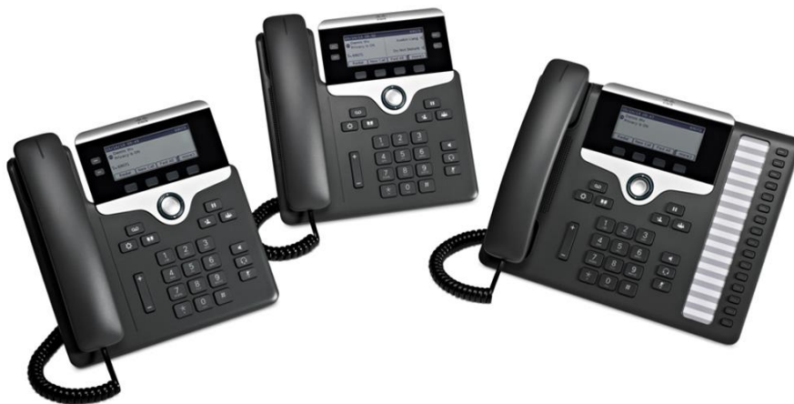
Figure 1. Cisco IP Phone 7800 Series

The line keys on each model are fully programmable. You can set up keys to support either lines, such as directory numbers, or call features like speed dialing. You can also boost productivity by handling multiple calls for each directory number, using the multi-call per-line appearance feature. Tri-color LEDs on the line keys support this feature and make the phone simpler and easy to use.