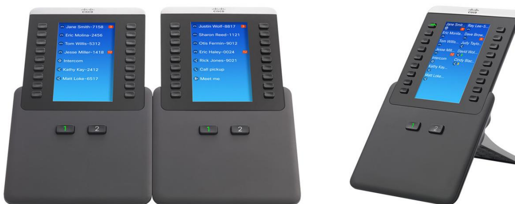
Figure 1. Cisco IP Phone 8800 Key Expansion Module

Quickly adapt to market changes. Increase productivity. Improve competitive advantage through speed and innovation. And deliver a rich-media experience across any workspace securely and with the best possible quality. Cisco® Unified Communications Solutions enable the collaboration that makes this possible (Figure 1).