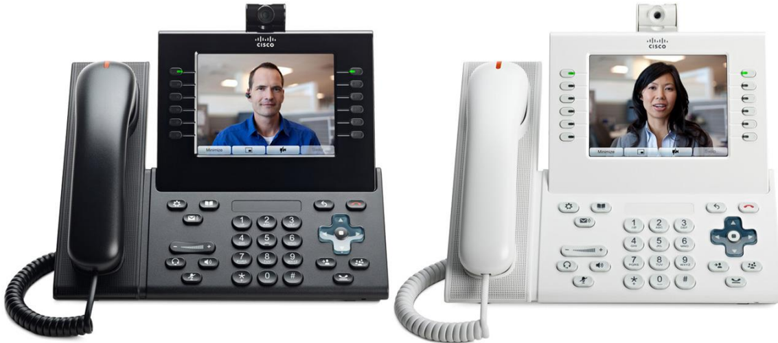
Figure 1. Cisco Unified IP Phone 9971