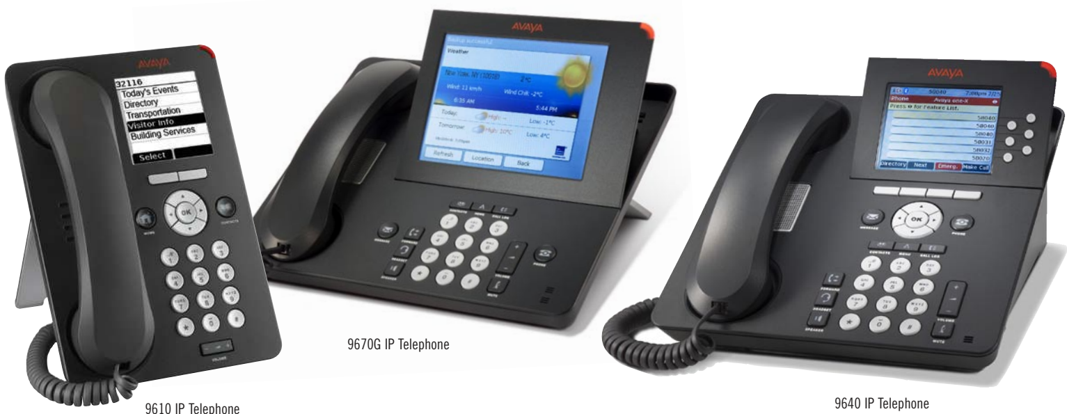
9610 IP Telephone

For the Navigator: the 9650 and Button Module. The Navigator also spends a great deal of time on the phone, largely handling calls for others. Receptionists and executive assistants are examples of Navigators. The 9650 provides one touch access to a great